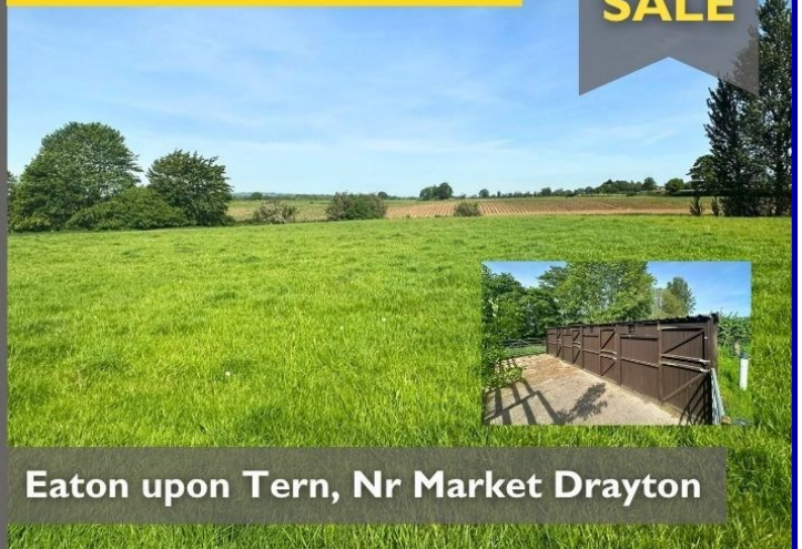
Eaton upon Tern, Nr Market Drayton

LAND WITH STABLES AND A NATURAL STREAM ON THE EDGE OF SOUGHT-AFTER VILLAGE