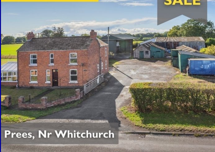
Prees, Nr Whitchurch

3 BEDROOM HOUSE IN NEED OF MODERNISATION WITH EXTENSIVE RANGE OF FARM BUILDINGS