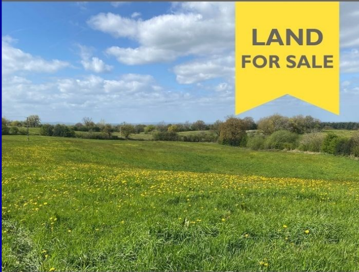
Land off Gravenhunger Moss Lane, Woore 7.24 Acres | Permanent pasture Guide £100,000