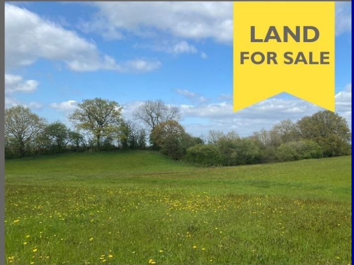
Hollow Meadow, London Road, Woore 3.95 Acres | Permanent pasture Guide £50,000

Interested? Contact Annabel or Kirsty from our property sales team on 01630 692 500 or email sales@barbers-rural.co.uk