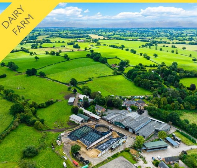
209.29 Acres | © Hunsterson, Cheshire

3 bed period farmhouse | extensive range of buildings available as a whole or in 2 lots | EPC E