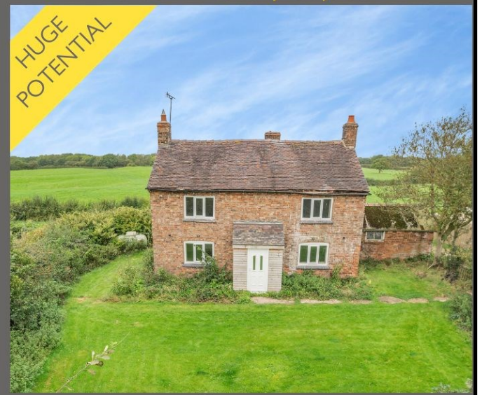
69.85 Acres | © Nr Woore, Shropshire farmhouse requiring extensive modernisation large agricultural building | pasture land | EPC F