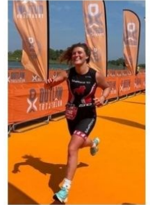
Outlaw 70.3 (1.2 Mile Swim, 56 Mile Bike, 13.1 Mile Run)