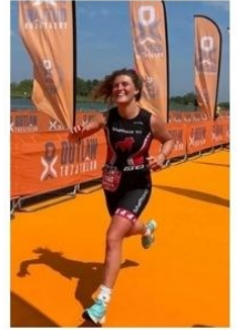
Outlaw 70.3 (1.2 Mile Swim, 56 Mile Bike, 13.1 Mile Run)